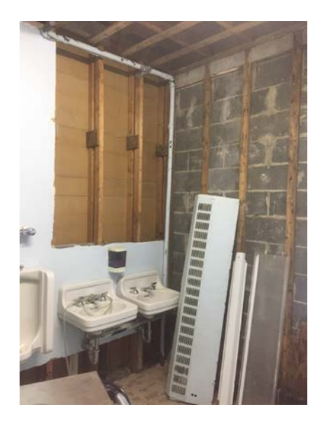
First floor men's bathroom