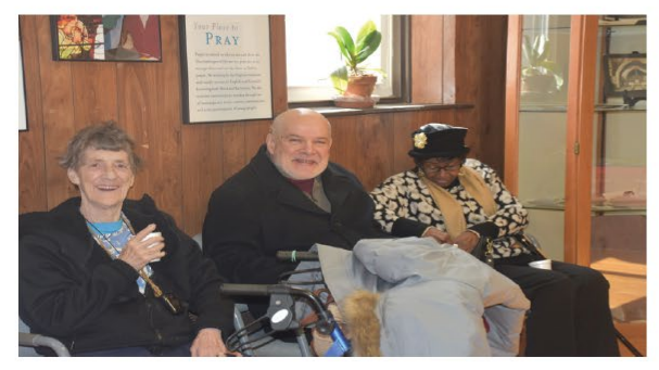
Before the Pandemic