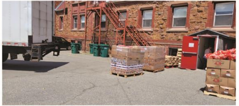
The Food Pantry Receiving the food, filling the bags, and setting up distribution